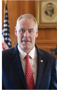
Ryan Zinke United States Secretary of the Interior

Thursday December 6, 2018 12:15 - 2:15 Spokane Convention Center Room TBD